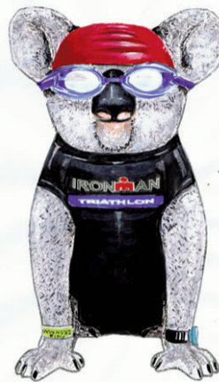
■ Ironman Koala.