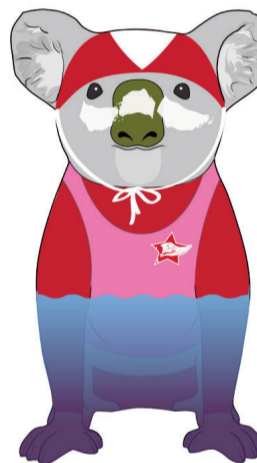
■ Little Nipper.